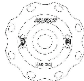
Figure 2 Top View of Cap showing Hard, Soft adjustments